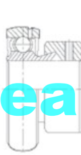
SSA200G Relubricatable Type